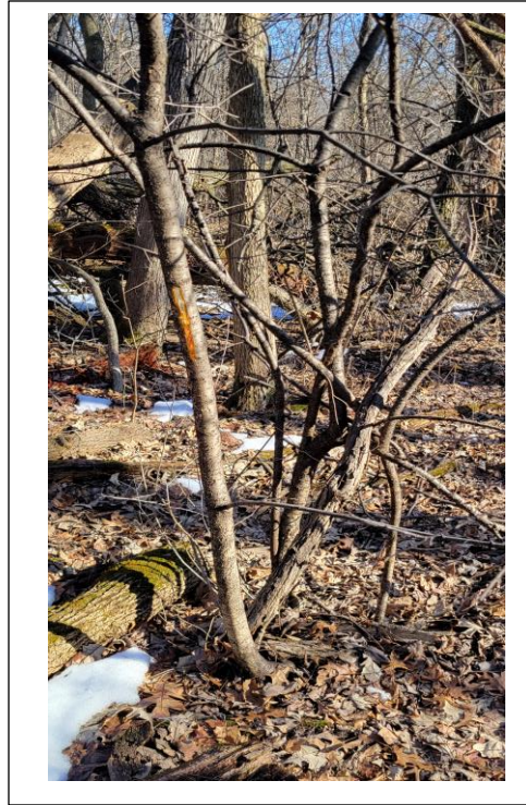
Common buckthorn saplings