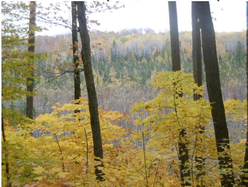
Just east of Nelson Firelane, a vista from Blackberry Ridge.

An April 2011 tornado devastated a portion of the segment south of 5 Cent Road. The Ice Age Trail is shown as red dashes but the section in the tornado affected trail is closed between the red Xs shown on the following map. A re-route via ATV/UTV trails on the Parrish Game Trail Fire Lane and Five Cent Road is provided until the chapter is able to re-establish the original trail.