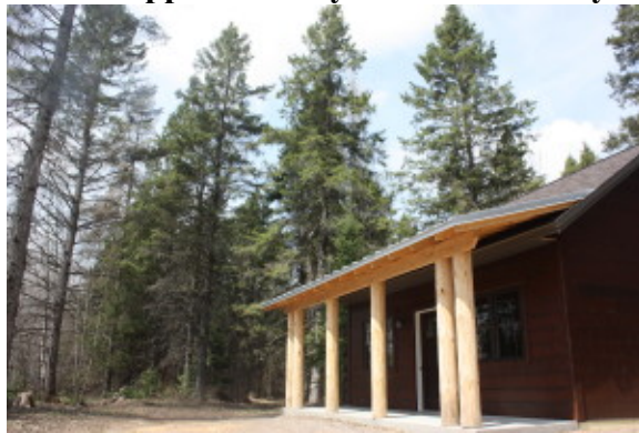
Spsychalla Lodge-Old Railroad Segment at Jack Lake Cross Country Ski Area, County Trunk J.

Starting Friday, May 18 th at 7 am, approximately 4 miles of this segment from County Highway A to Pence Lake Road and the rail grade north of County Highway J to just west of Spsychalla Lodge will be officially used as part of a county ATV-UTV trail.