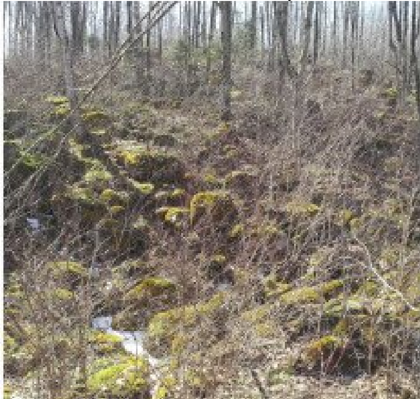
Boulder field on South Slope of Summit Lake Moraine east of Baker Lake

LUMBERCAMP - Distance: 12 miles Wisconsin 52 to County Trunk A