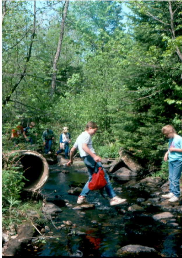
The trail crossing of the Eau Claire River's west branch. A babbling brook or raging torrent?