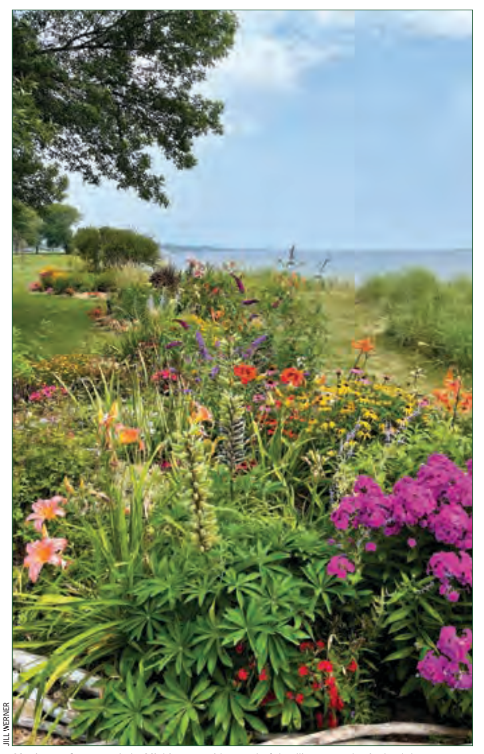
Manitowoc Segment: Lake Michigan provides a colorful pollinator garden its backdrop.