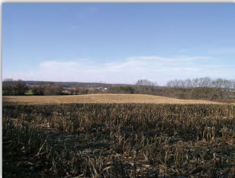
An expansive view at the edge of the Moraine Woods Conservation Park is one reason the opportunity to build trails on this property is so exciting.