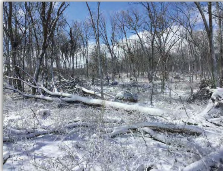
The snowy woods on this property will continue to provide an important habitat for birds and animals, and a place to hike and explore for humans, throughout the seasons.