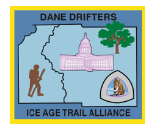
Join the Dane Drifters and then hike all the beautiful IAT segments in Dane County. You'll earn this cool patch and a certificate of completion.

Check the enclosed calendar to see what we have planned for the coming months.