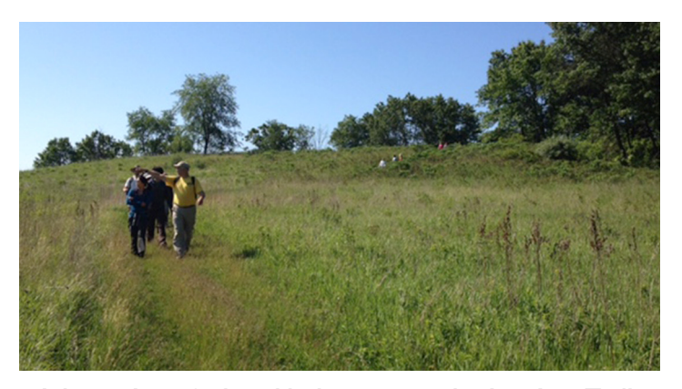
Join us June 3rd and help support the Ice Age Trail.

To get more information, and to sign up for the 2017